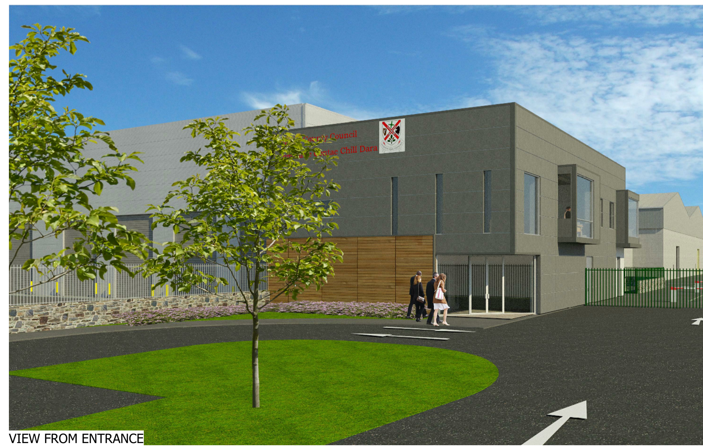
VIEW FROM ENTRANCE